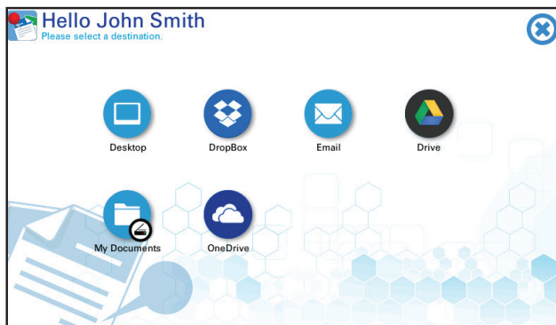
Easy access to PinPoint Scan 3 destinations from the MFP control panel