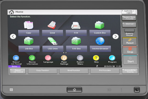
CS 9003i / 8003i / 7003i